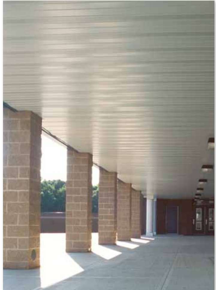
E-375 3/8" Soffit Panel

Englert Series E-375 Soffit Panels will provide a net free ventilation area (NFVA) of 6.528 square inches per square foot.