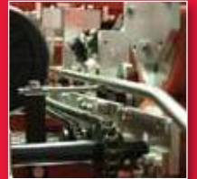
POLYURETHANE DRIVE ROLLERS