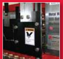
CHOP STYLE SHEAR