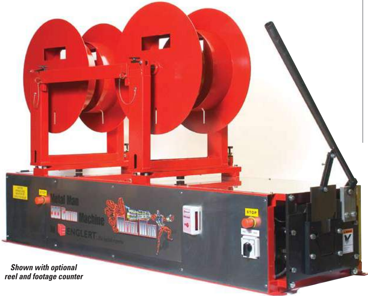
Shown with optional reel and footage counter

Englert Inc. brings in-plant manufacturing to the job site.