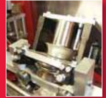
INDEPENDENT FORMING STATION

Introducing the Englert Metal Man Series 555 T portable gutter forming machine. This revolutionary gutter machine is the first of its kind – designed to fit in the back of any commercial vehicle and most small pick-up trucks. Now you can enjoy the same state-of-the-art features afforded you in the larger Metal Man Series gutter machines at an extremely affordable price. Its compact design and durable construction, featuring a separate polyurethane drive roller system, free floating rollers and chop style shear make the Metal Man 555 T gutter machine the ideal choice for gutter professionals everywhere.