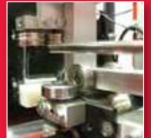
EXIT DRIVE STATION