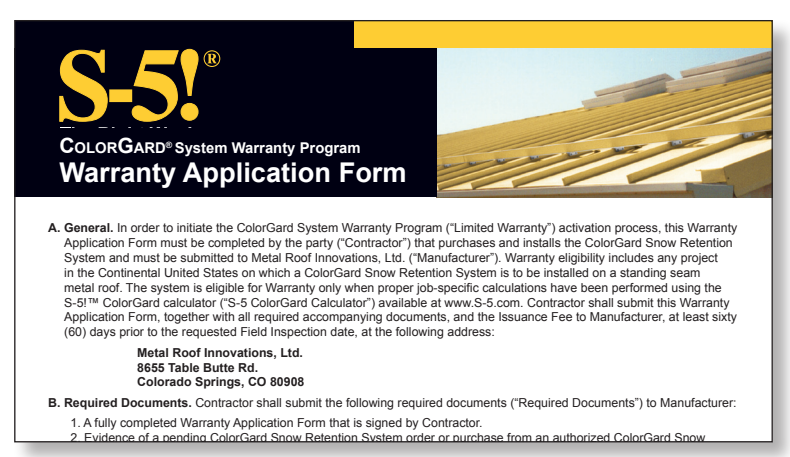
Step 2 - Apply